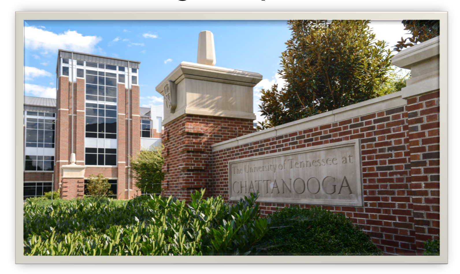
College of Arts & Sciences