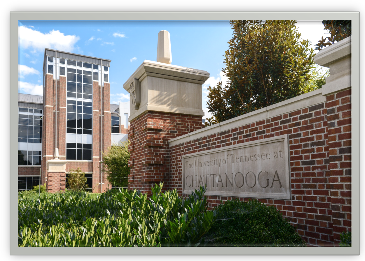
Enrollment Management and Student Affairs (EMSA)