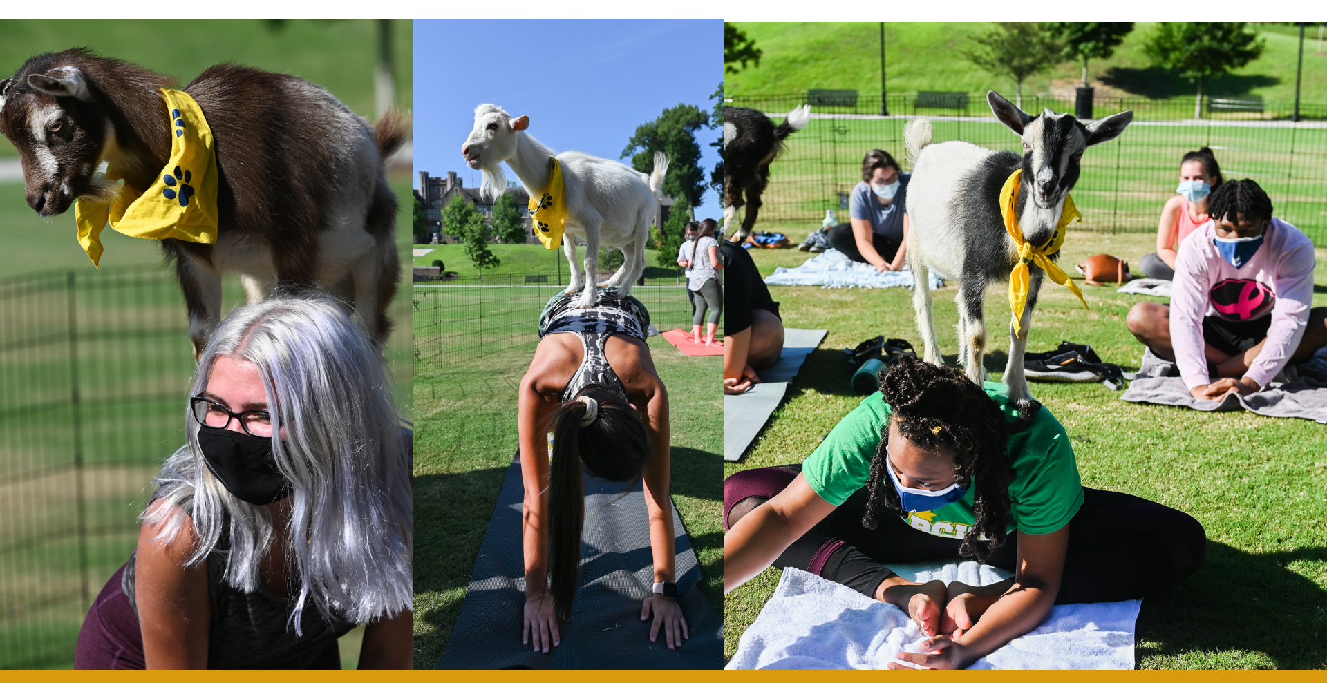
Center for Student Wellbeing and the Office of Student and Family Engagement