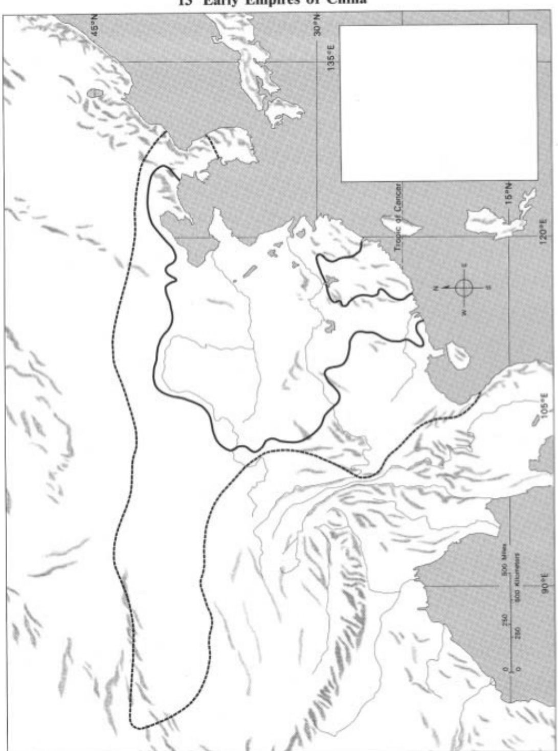
@ Prentice-Hall, Inc.